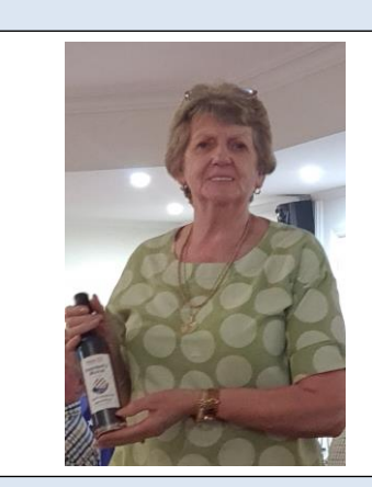
Cut the cards: Barrie