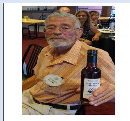
Cut the cards: