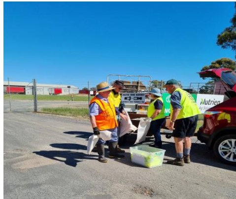
Look we also have walking space in our shed, no more trip hazards!