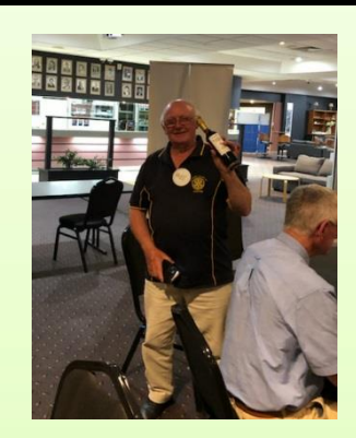
Cut the Cards: Rav