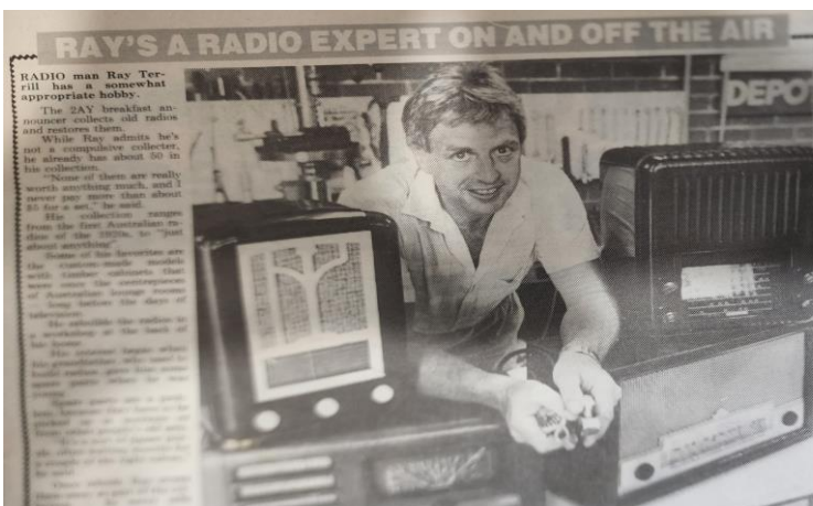
The man with the face for radio!

As we strive to strengthen the bonds of understanding, goodwill and friendship, these policies still provide good advice and guidance.