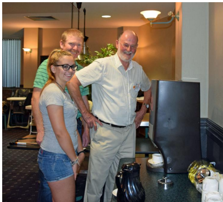
Some time for Rotary gossip at the coffee machine.